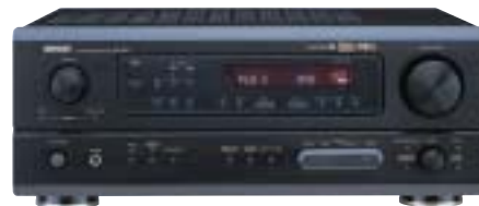
Front panel with terminal cover.

(*1) Note on Movie mode: On DENON A/V receivers, this Movie mode is displayed as "MODE CINEMA".