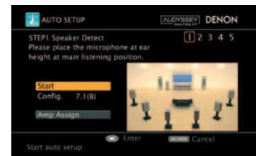
*Sample image of new GUI