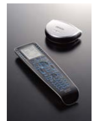
*Optional RC-7000CI and RC-7001RCI