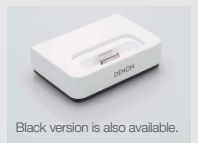
Black version is also available.

*1) Supports 3rd-generation and later iPods equipped with a Dock connector. Some functions may not work depending on the generation of the iPod and the version of the software.